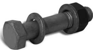
Structural Bolting Assemblies