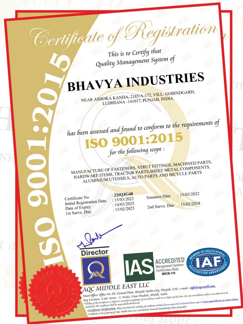
AN ISO 9001:2015 CERTIFICATE