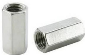
Coupler / Long Nuts