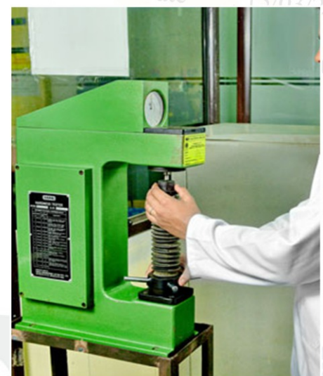
Product Testing & Inspection