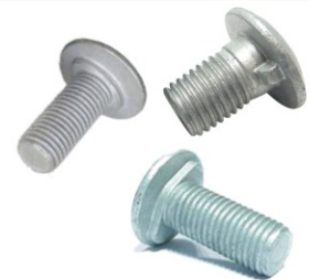
Nib & Guard Rail Bolts