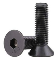
CSK Head Allen Cap Screw