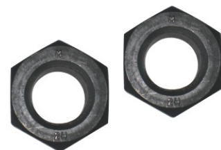
2H Heavy Hex Nuts