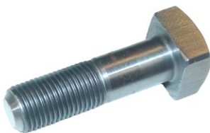
Square Head Bolts