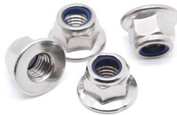
Flange Nylock Nuts