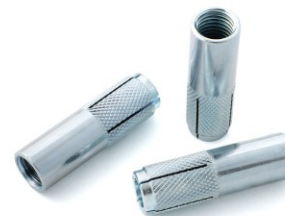
Drop In Anchors

Grades: 4.6, 8.8, 10.9 | Standards: DIN 976