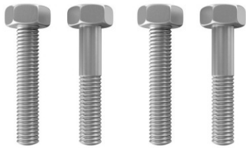
Hex Bolts & Screws