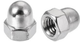
Dome / Cap Nuts